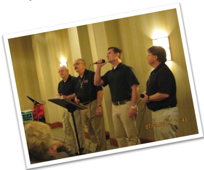
Work in Progress—Performing at the Awards Luncheon